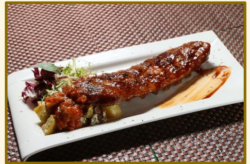
872. 鋪天薯條® 配醬燒豬仔全骨