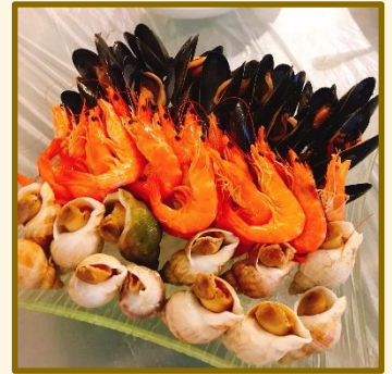
861. 開心海鮮拼盤 (三倍)