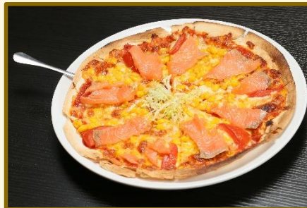
823. 蕃茄煙三文魚 PIZZA