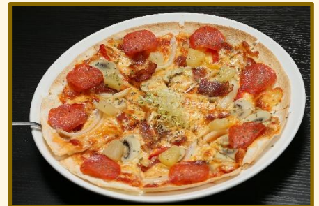
824. 豪華至尊 PIZZA

星期一至五 2:00-5:30pm 惠顧任何飲料，食物半價優惠 (公共假期除外)